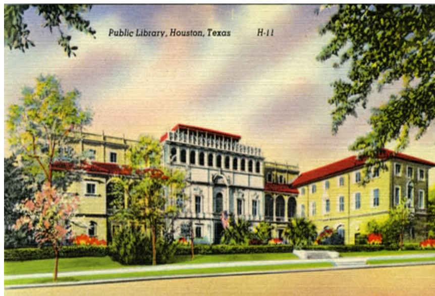
The Julia Ideson Building

VISIT THE FRIENDS OF THE TEXAS ROOM WEBSITE! www.friendsofthetexasroom.org