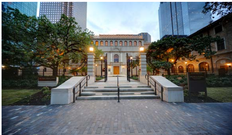
McKinney Entrance to the Julia Ideson Building

Hispanic Heritage Month extended from September 15 th - October 15 th this year. HMRC, as in past years, celebrated this observance through programs, exhibits, tours, and displays that honor the contributions of the Houston's Hispanic community. This year we decided to tie Hispanic Heritage Month activities with the upcoming election in November and to Citizenship Month which is recognized during this same month.